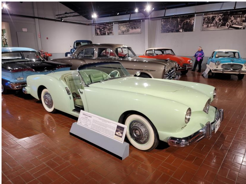
A 1954 Kaiser Darrin at the Gilmore Car Museum in Mi.