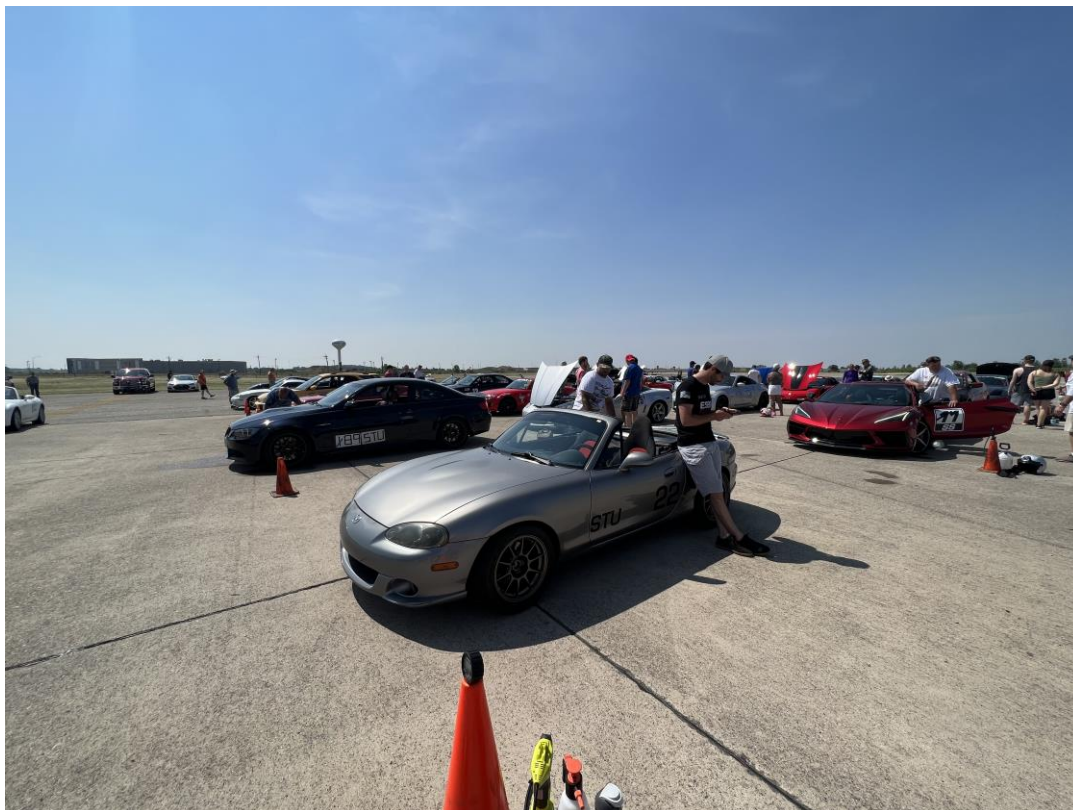
An active grid at one of our Solo's at Grissom