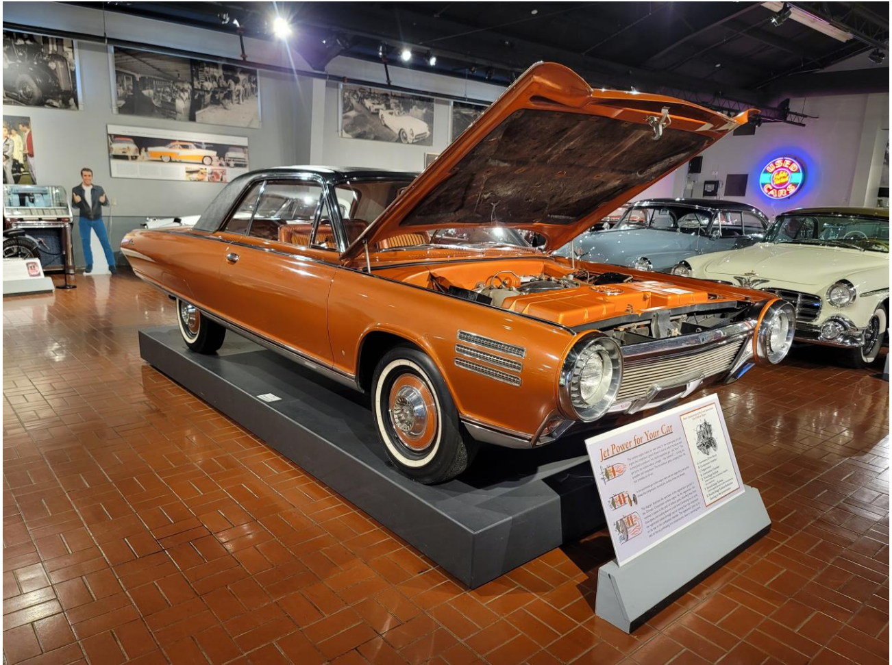
A 1963 Chrysler Turbine car at the Gilmore Museum in Hickory Corners, MI.