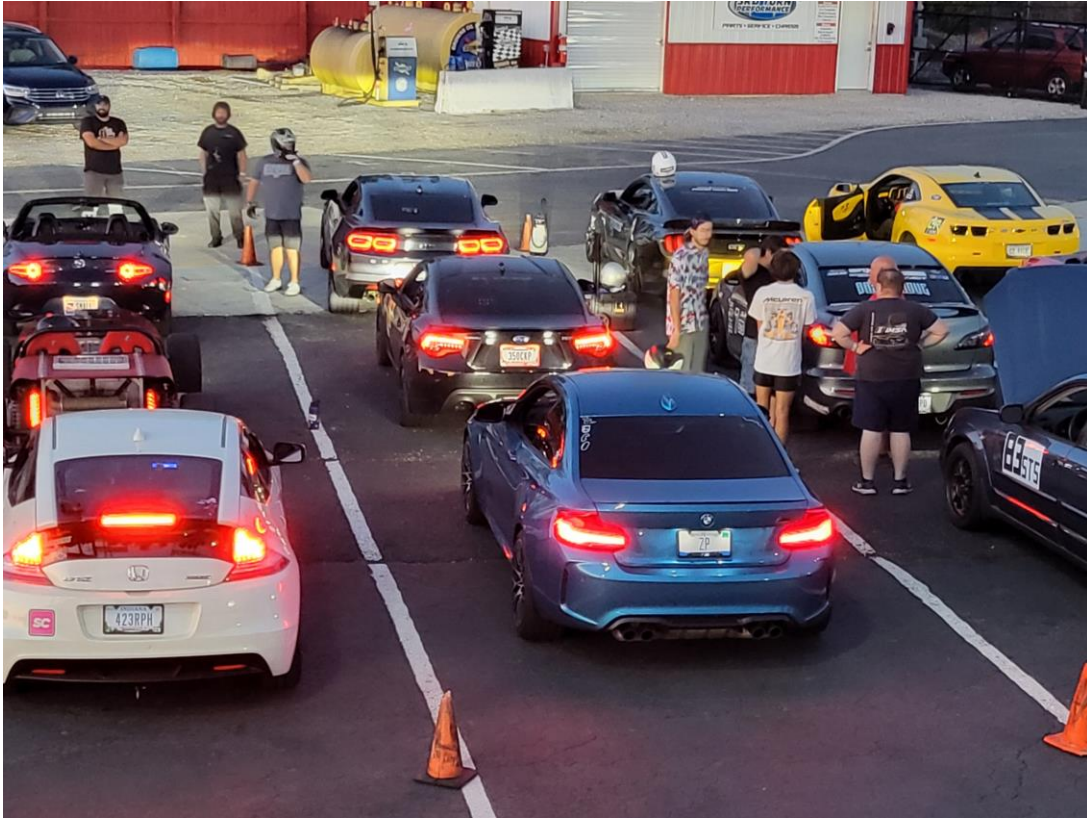
Another picture of our “Solo Under the Lights” in September