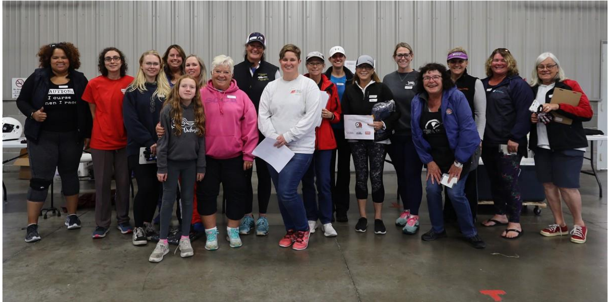
Ladies attending the “Women on Track” party at NCM during the Time Trial Nationals